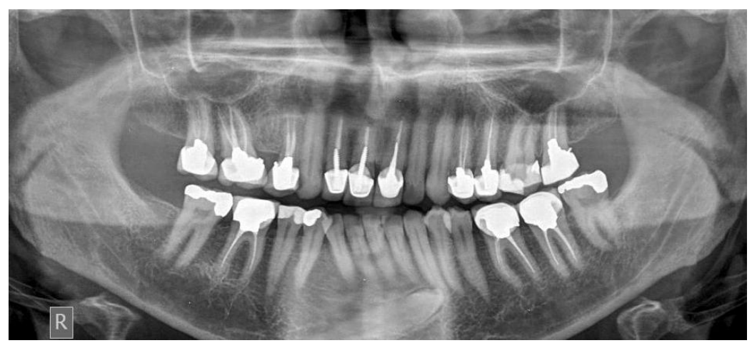
Figure 2. The panoramic radiograph revealed a transmigrated mandibular right canine causing the root resorption of the contra lateral side canine