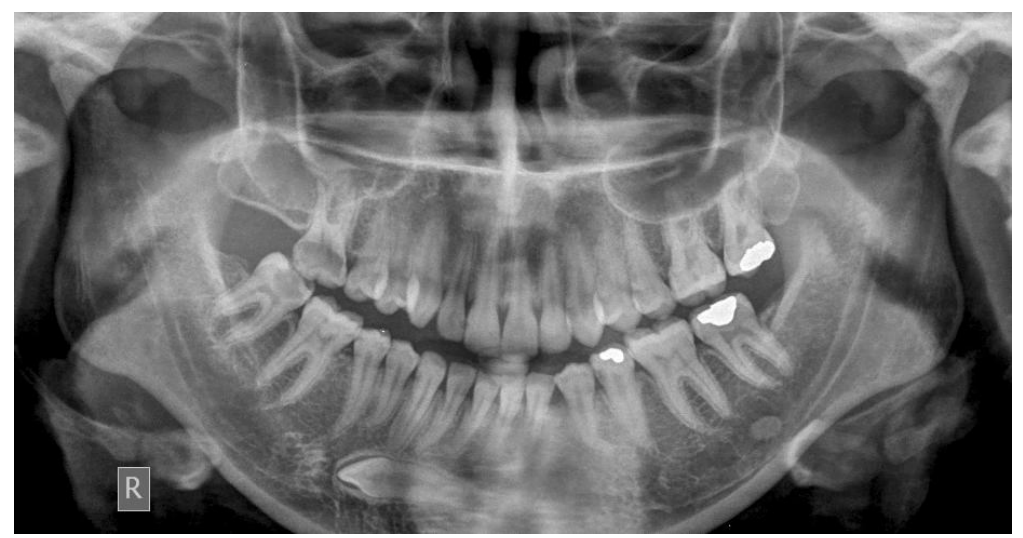
Figure 1. The panoramic radiograph revealed a transmigrated mandibular left canine which had completely crossed the midline

A 45-year-old man was referred to our clinic. His clinical intra-oral examination showed that the mandibular dental midline was shifted to the right. The panoramic radiograph revealed a transmigrated mandibular right canine causing the root resorption of the contra lateral side canine (Fig. 2).