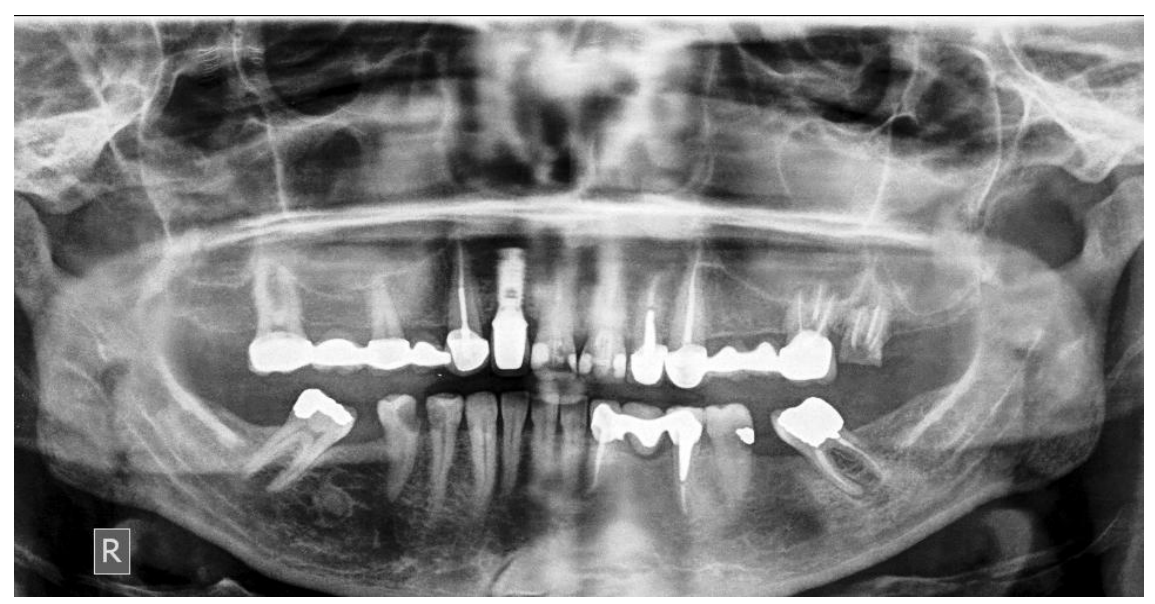
Figure 4. The impacted mandibular left canine migrated to the right side