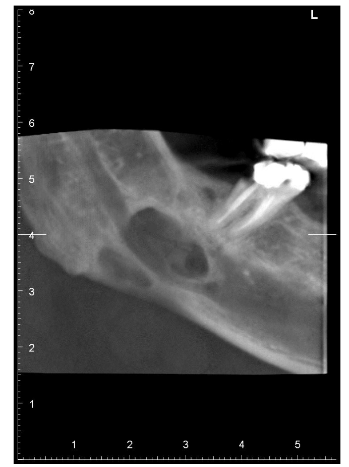
Figure 3. Panoramic radiograph ten months later.