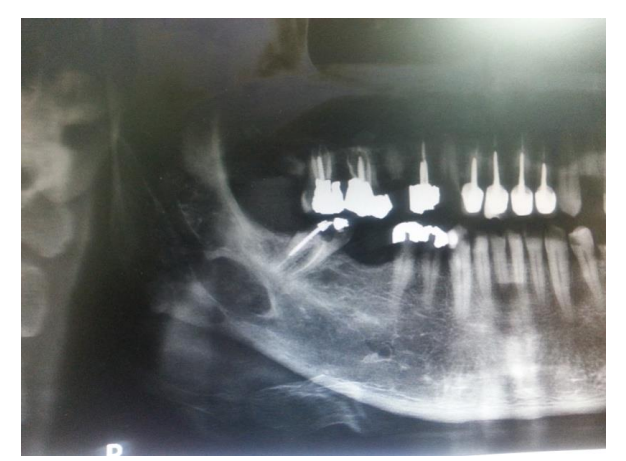
Figure 1. Panoramic x-ray reveals a bilocular radiolucency with clear sclerotic boundary, above and below the inferior alveolar canal at the root of the second molar in the right mandibular body.

A bilocular Stefne bone cyst above the canal was diagnosed based on panoramic and CBCT images and lack of any particular clinical signs. The patient was advised to return in 6 months in order to measure the size of the radiographic defect (Fig 3).The size and shape of defect had remained unchanged after ten months.