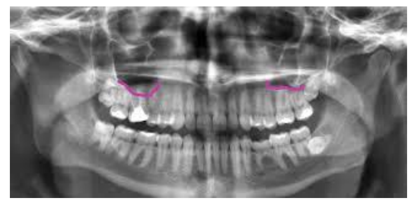
Figure 2. Type 4 of root-maxillary sinus floor relationship .In the right side the first molar root penetrates to the maxillary sinus.