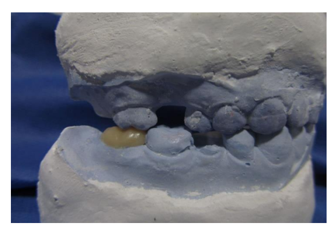
Figure 5. Final composite mock-up "lateral view".

Making a rigid tray: A thermoplastic 0.9 mm thick rigid tray (Rigid-Tray® Sheets, ULTRADENT INC, USA) is fabricated over the lower master cast using a vacuum press machine (T&S Dental & Plastic Co. USA). The tray is trimmed off using a scalpel blade 3-5 mm apical to the gingival margin. A pair of small curved scissors can be used to remove the rough edges if necessary. Fitness is checked by matching the tray with the master cast and rechecked in the patient's arch. An occlusal window needs to be made by cutting the tray with scalpel and scissors, or dental bur (Fig. 6).