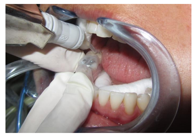
Figure 8. Injecting glass- ionomer through the rigid tray occlusal window