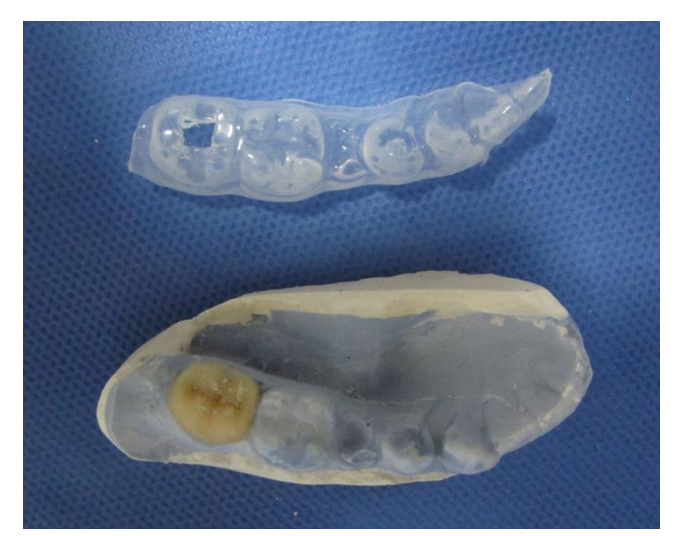
Figure 6. Final composite mock-up with perforated rigid tray