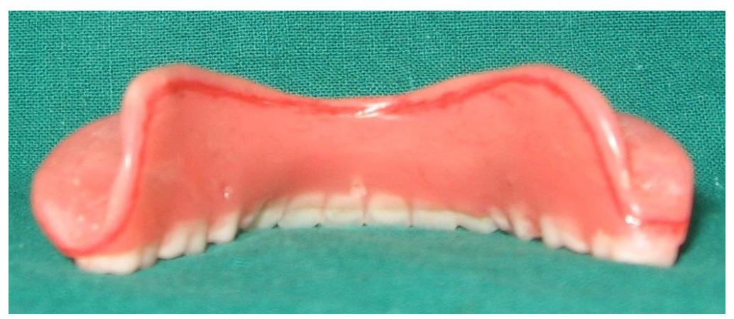
Figure 1. Denture with line drawn 2 mm below border