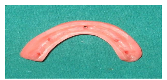
Figure 2. Denture after border reduction and drilling of holes