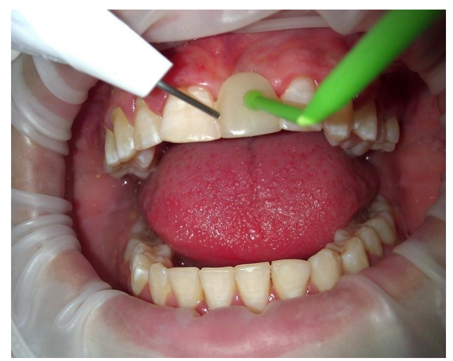
Figure 2. Temporary stabilizing the pontic with flowable composite

HASUNDUMA-CHO, ITABASHI-KU, TOKYO, JAPAN) was taken from the treatment arch while the detached pontic was in its exact place.