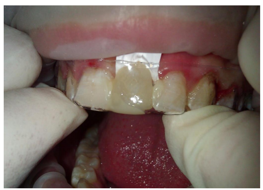
Figure 5. Placing the splint containing the prepared pontic in its proper position

8- Finalizing the restoration and occlusal adjustment: Excess composite was removed to make an appropriate shape with diamond bur using high speed handpiece and cooling water. If necessary, the color and texture can be corrected in this step. In order to follow the golden proportion rule in this case, gingival part of the pontic was formed by gingiva-colored composite. Next the occlusion was carefully adjusted. Then finishing and polishing were done with # 12 scalpel, diamond burs, Softlex polishing disks (3M, ESPE,