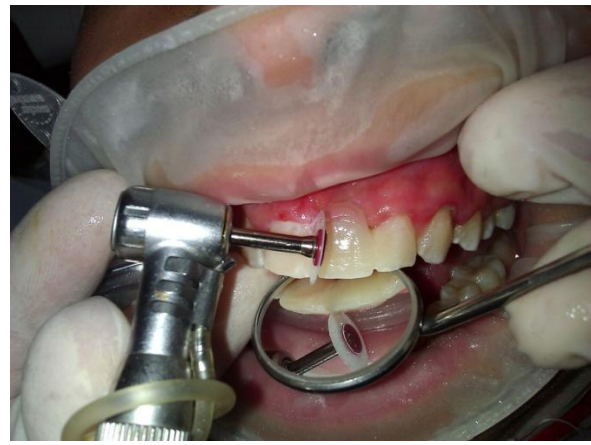
Figure 6. Finishing and polishing