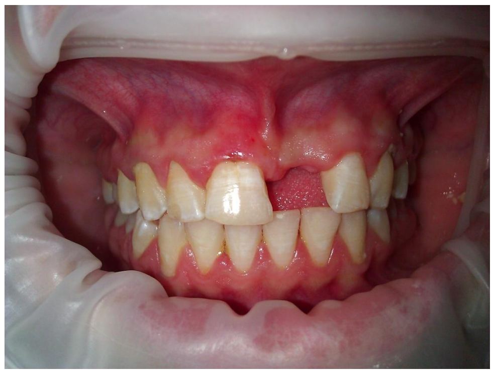
Figure 1. Missed/detached composite tooth pontic

2-Temporary stabilization: Considering the occlusion, the pontic was fixed in its proper place using a stick to non-etched enamel of adjacent teeth with flowable composite (Fig. 2).