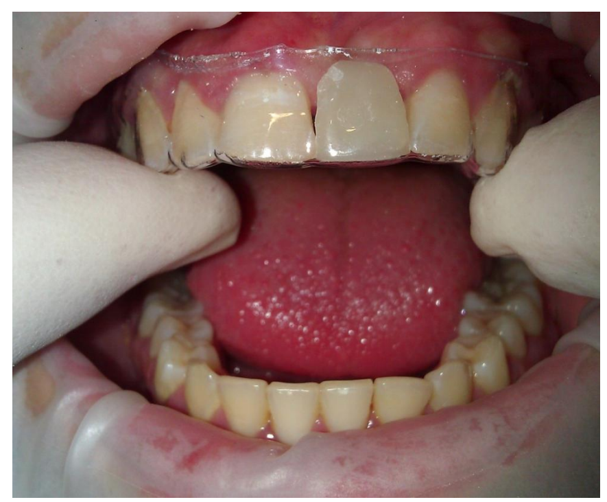
Figure 4. Checking the tray while the detached pontic in its place