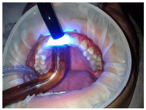
Figure 7. Post curing both from buccal and lingual simultaneously