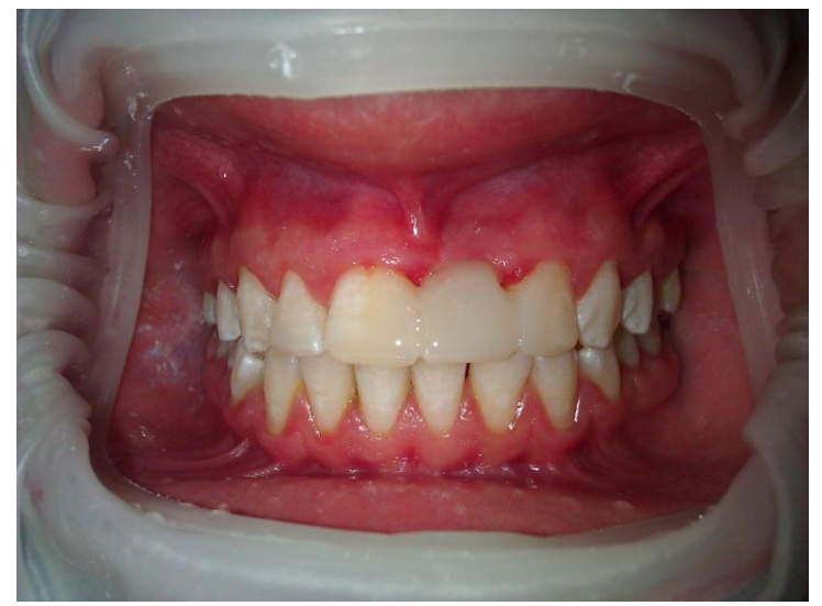
Figure 8. Final result