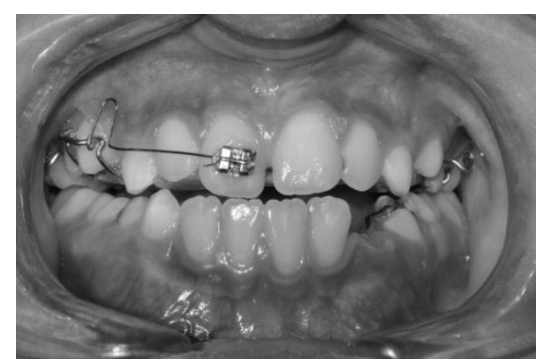
Figure 5. Intraoral photograph of patient after 8 months