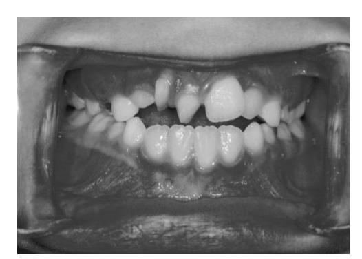
Figure 2. Intraoral examination of patient before treatment