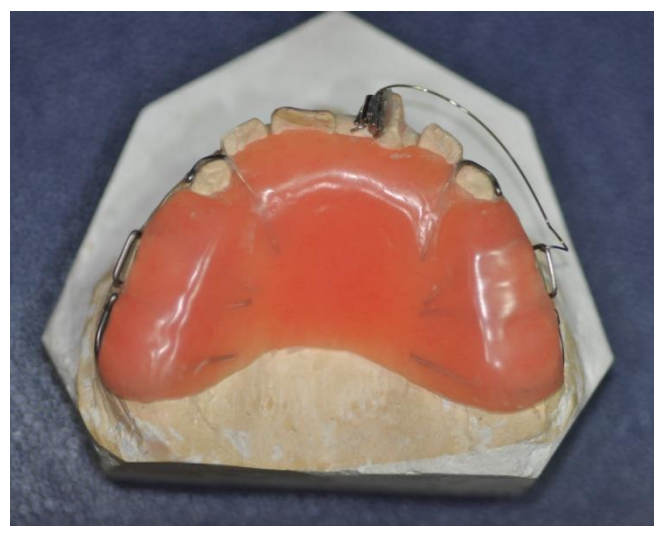
Figure 1. The Whip appliance

After over correcting the tooth rotation, a periodontist can perform circumferential supracrestal fibrotomy to prevent relapse. One week after fibrotomy, the appliance is removed and retention begins using a modified Hawley retainer with an acrylic bar on its labial bow.