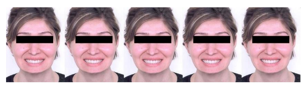
Figure 2: Illustration of different amounts of angular midline deviation in short face patient in an increasing deviation sequence, from no deviation to 14° deviation