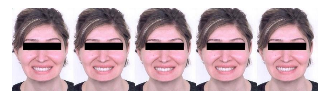
Figure 1: Illustration of different amounts of linear midline deviation in short face patient in an increasing deviation sequence, from no deviation to 4mm deviation

Frontal facial smiling photographs of both patients were altered using Adobe Photoshop CS3 software (Adobe Systems, San Jose, CA). Four photos with different midline deviations to right (1mm, 2mm, 3mm, 4mm) and four other photos with counter clockwise midline inclination (2°, 6°, 10°, 14°) were produced. One normal photo from each situation was taken too. Patients` eyes were covered. Buccal corridors were adjusted to be the same in both sides. (Figure 1-4)