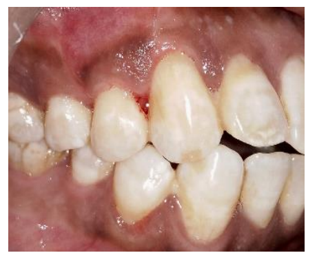
Figure 5. Postoperative View (one month)