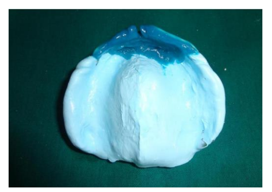
Figure 8. Mucostatic & mucodisplacive mishmash final impression