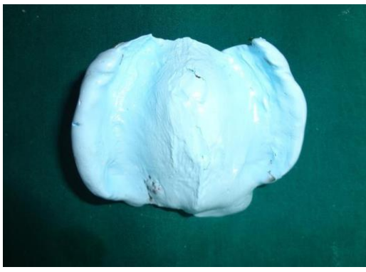
Figure 5. Final mucodisplacive impression of the firm supported areas

• Tray adhesive was applied around the border of the tray of the first impression in the flabby area & the tray was inserted into the patient's mouth, then putty body of the rubber base impression material (Speedex, Coltene, Whaledent product, Switzerland) was placed over the flabby ridge area & molding of the impression material around the labial border was done to record the impression (second stage impression) of the flabby area (Fig 6).