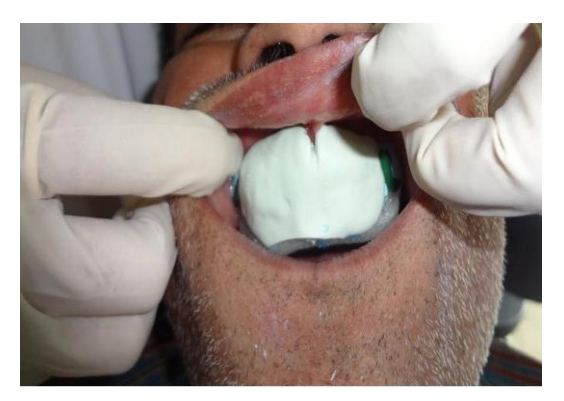
Figure 6. Putty body impression of flabby anterior ridge by mucostatic technique

• Tray adhesive was applied around the border of the tray of the first impression in the flabby area & the tray was inserted into the patient's mouth, then putty body of the rubber base impression material (Speedex, Coltene, Whaledent product, Switzerland) was placed over the flabby ridge area & molding of the impression material around the labial border was done to record the impression (second stage impression) of the flabby area (Fig 6).