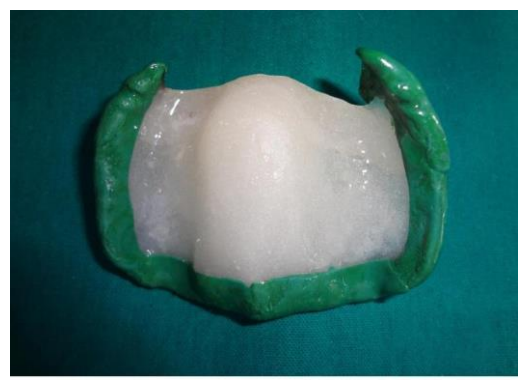
Figure 3. Border molded tray of the firm supported areas

Tray adjustment & border molding of the firm supported areas was carried out and then impression was recorded with zinc oxide paste (Cavex outline impression paste, Ultimate dental, Moorabbin, Melbourne) (Fig 3, 4, & 5).