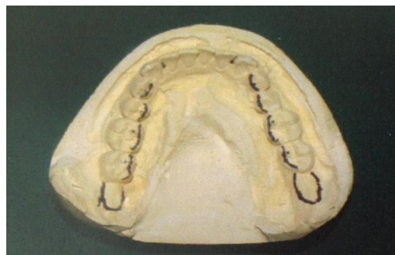
Figure 2. The lingual cusps and retromolar pad was marked on the casts

Data were analyzed with SPSS version 16.0 (Microsoft Inc., IL, USA). Absolute and relative frequencies were presented for each posterior tooth separately.