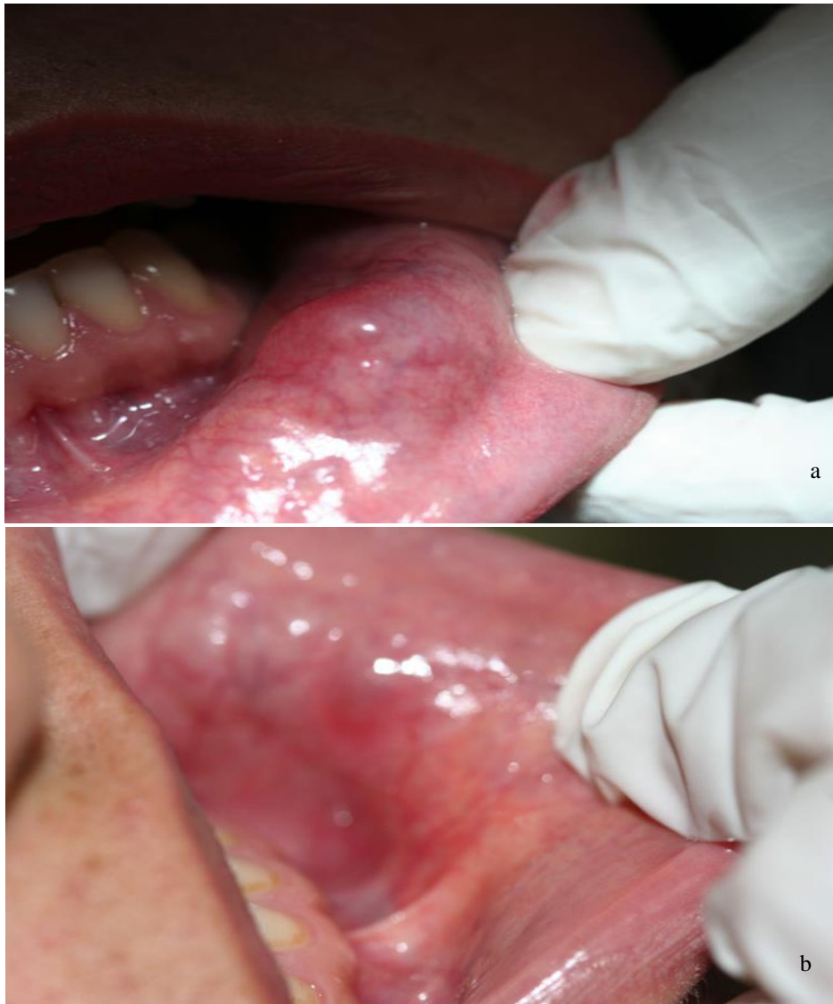
Figure 1. The full size mucocele before (a) and after (b) treatment with intralesional dexamethasone

Medical Ethics Committee of Shahid Beheshti University of Medical Sciences approved the study ethically in accordance with Helsinki Declaration. An informed written consent was obtained from all patients before injection.