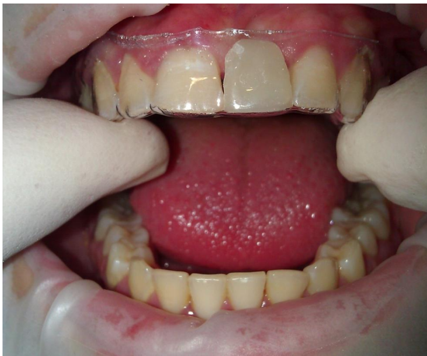
Figure 4. Checking the tray while the detached pontic in its place