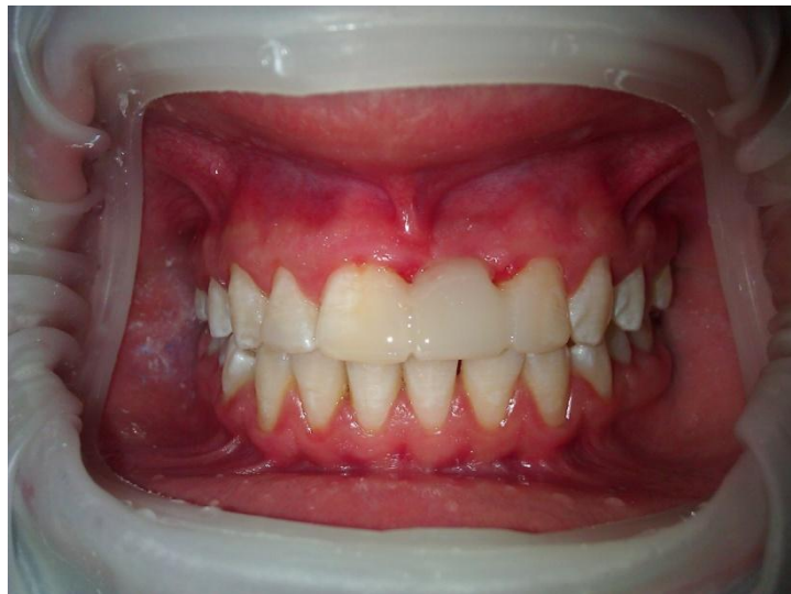
Figure 8. Final result