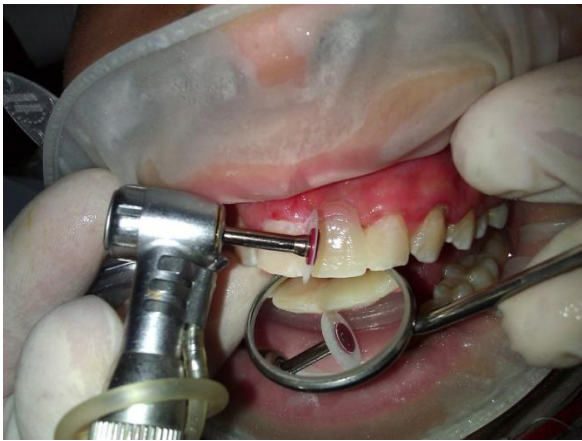
Figure 6. Finishing and polishing