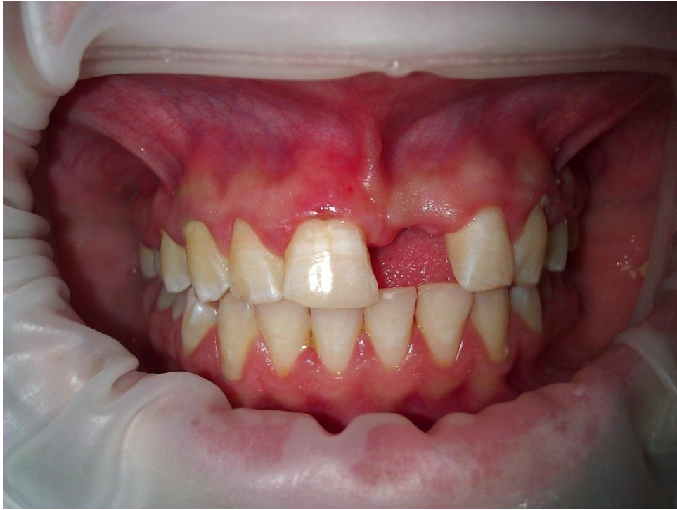
Figure 1. Missed/detached composite tooth pontic

2-Temporary stabilization: Considering the occlusion, the pontic was fixed in its proper place using a stick to non-etched enamel of adjacent teeth with flowable composite (Fig. 2).