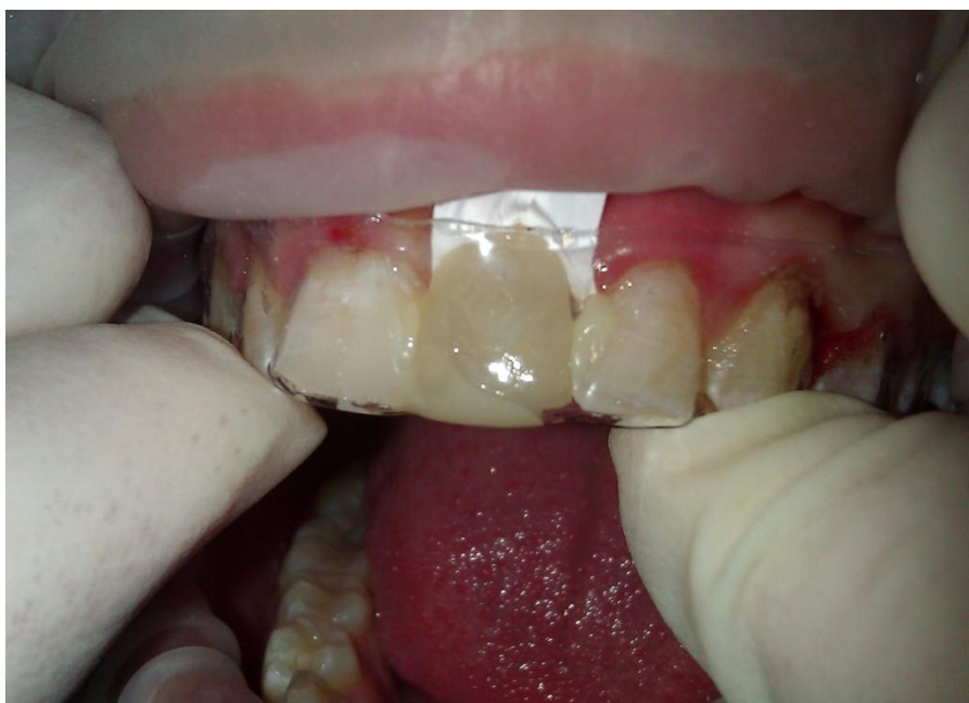
Figure 5. Placing the splint containing the prepared pontic in its proper position

8- Finalizing the restoration and occlusal adjustment: Excess composite was removed to make an appropriate shape with diamond bur using high speed handpiece and cooling water. If necessary, the color and texture can be corrected in this step. In order to follow the golden proportion rule in this case, gingival part of the pontic was formed by gingiva-colored composite. Next the occlusion was carefully adjusted. Then finishing and polishing were done with # 12 scalpel, diamond burs, Softflex polishing disks (3M, ESPE,