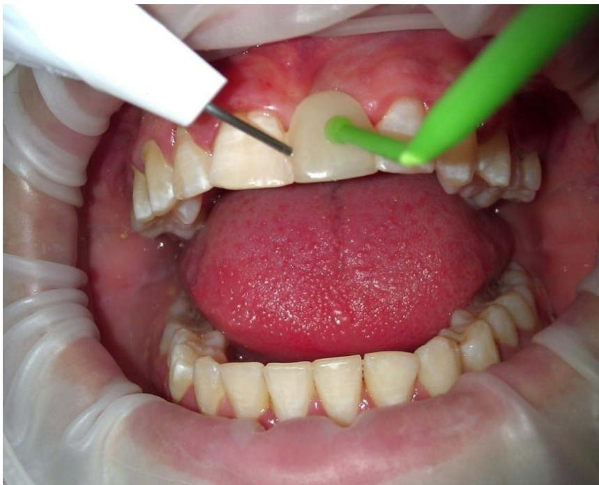
Figure 2. Temporary stabilizing the pontic with flowable composite

HASUNDUMA-CHO, ITABASHI-KU, TOKYO, JAPAN) was taken from the treatment arch while the detached pontic was in its exact place.