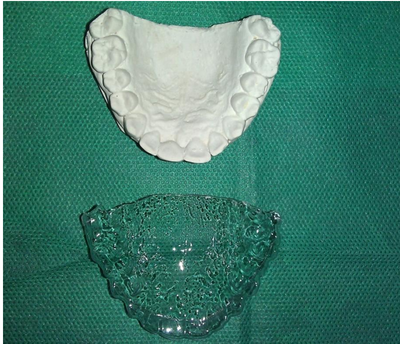
Figure 3. Prepared rigid tray

4-Making master/working cast: Using dental stone (Moldano, Bayer, Leverkusen, Germany) a master/working cast was made.