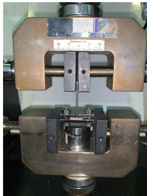
Figure 1. Edge chipping test assembly

In this equation, F (N) represents the chipping force, d (mm) is the distance from the edge, and T_e (N/mm)