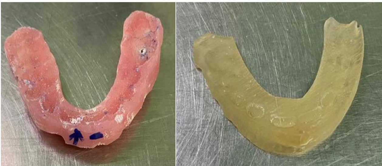
Figure 1. Conventional intermediate splint (left), which was 3D-printed to replicate the digitally designed splint (right).

Accuracy was calculated as the absolute difference (mm) between the planned and achieved displacement of point A in the primary direction of movement for each patient (horizontal advancement or vertical impaction).