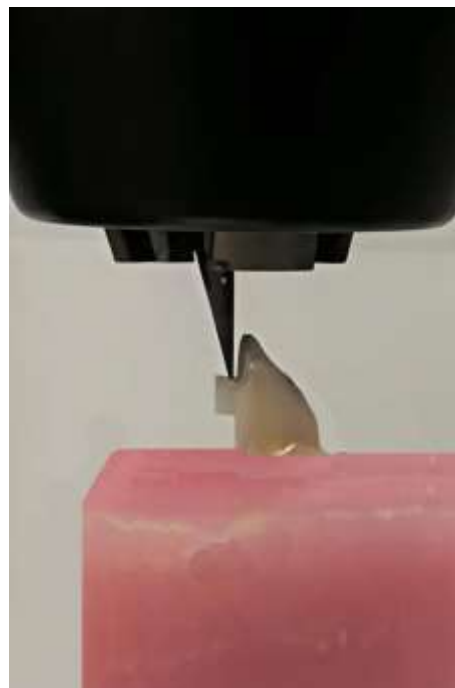
Figure 1. A specimen undergoing bond strength testing

Table 1 presents the mean and standard deviation (SD) of SBS values in the study groups. One-way ANOVA indicated a significant difference in SBS among the