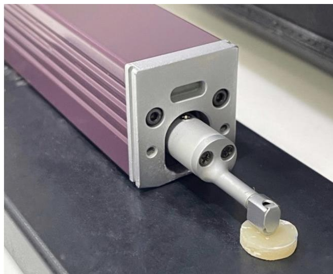
Figure 3. Evaluating the surface roughness value of the composite disk specimen using the SJ-310 Mitutoyo stylus profilometer