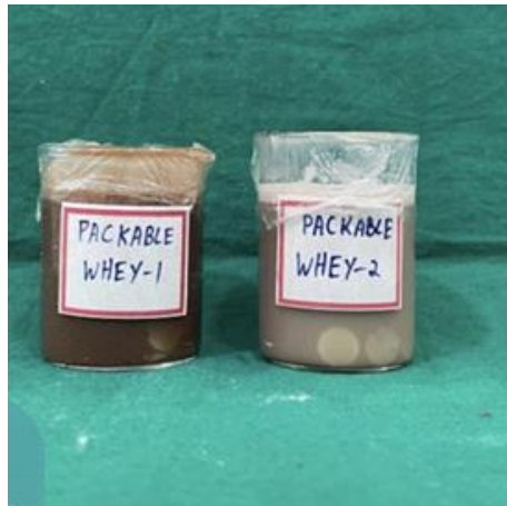
Figure 2. Ten resin composite disk samples were immersed in whey protein solutions, labeled as whey-1 and whey-2

Data were subjected to statistical analysis using SPSS 26.0 (IBM Corp., Armonk, NY, USA) software. The distribution of the data was assessed using the Shapiro-Wilk test. Since the data had a non-normal distribution ( P < 0.05 ), non-parametric tests were employed. The Wilcoxon signed-rank test was used to assess the pre- and post-immersion microhardness values in each study group. The Mann-Whitney U test was used to compare the microhardness values between the two groups. P-values less than 0.05 were considered statistically significant.