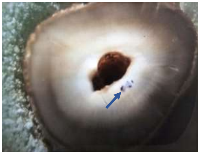
Figure 1. The microscopic view of a tooth cross-section. Microhardness was measured at 0.5 mm from the pulp–dentin junction.