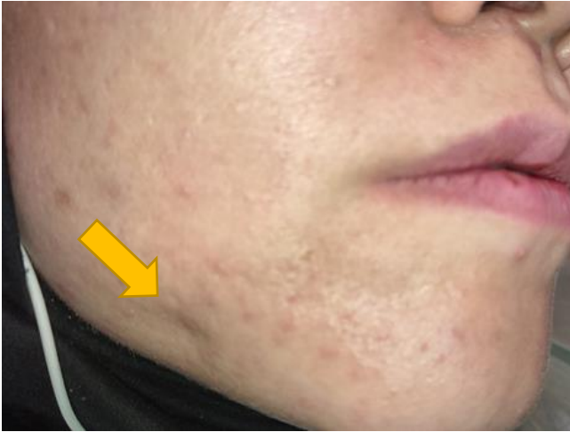
Figure 1. A pre-operative view of the scar (dimpling) marked by the yellow arrow

A 34-year-old healthy female with no systemic disease was referred to the Endodontics Department of Mashhad Dental School at Mashhad University of Medical Sciences, complaining of a skin dimpling on her right cheek (Figure 1). Upon taking the patient's history, it was revealed that she had a history of endodontic treatment of her right mandibular first molar in a private dental office two years earlier. The patient could not recall whether the skin dimpling appeared before or after the endodontic treatment. There was no drainage path on the skin, but the patient recalled a history of drainage in the past. Pulpal and periapical tests were performed for all of the teeth in the right mandibular quadrant. The right mandibular first molar had a brief dull pain on percussion and had a defective restoration. The remaining teeth exhibited a normal response. Palpation of the gingiva around the tooth revealed a cord-like drainage path in the vestibular depth at the site of the right mandibular first molar.