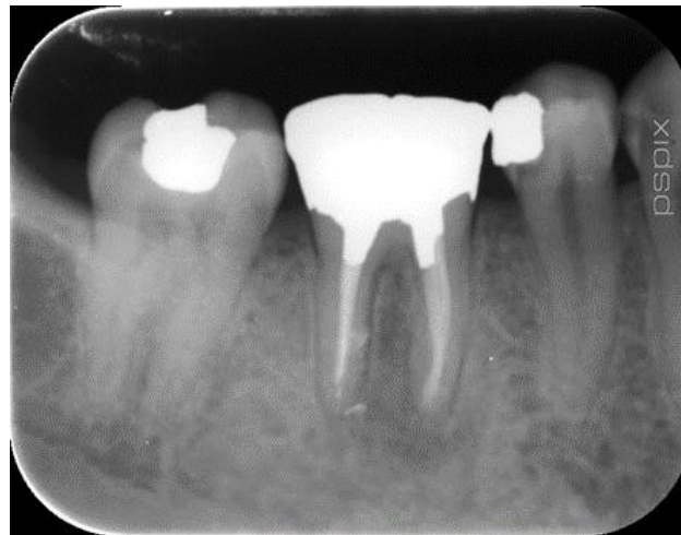
Figure 5. A periapical view at an 8-month follow-up