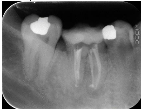
Figure 3. A periapical radiograph taken immediately after endodontic treatment

The patient was referred for definitive restoration 2 weeks after surgery. At the 6-month follow-up visit, periradicular healing was noted (Figure 5), and the facial skin had a normal contour.