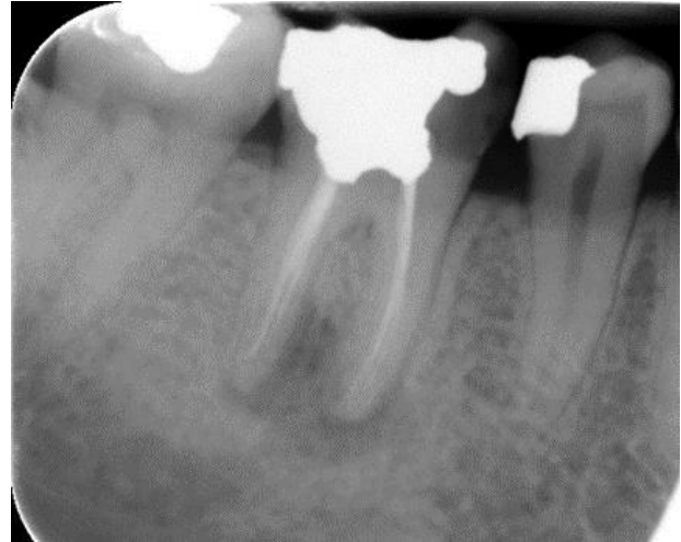
Figure 2. A pre-operative periapical radiograph showing poor quality of endodontic treatment and a defective restoration

The treatment plan consisting of endodontic retreatment of the right mandibular first molar and surgical removal of the cord-like tract was explained to the patient, and