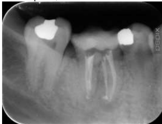
Figure 3. A periapical radiograph taken immediately after endodontic treatment

The patient was referred for definitive restoration 2 weeks after surgery. At the 6-month follow-up visit, periradicular healing was noted (Figure 5), and the facial skin had a normal contour.