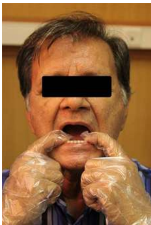
Figure 2: Placing the overdenture using hand pressure and applying vertical load