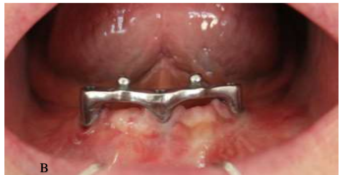
Figure 1. A: The mandibular overdenture of a patient including a cast substructure for connection to a bar and ball attachment (with 2.2 mm diameter). B: The implants and the stainless-steel housing to hold the nylon matrix.