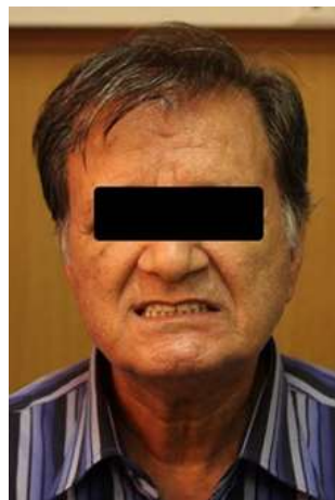
Figure 3: Insertion of overdenture by clenching of jaws with no hand involvement