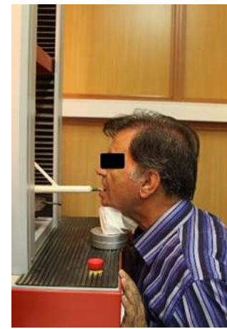
Figure 4: Fixing the patient's head in front of the retention measurement device, using a chin holder adjusted based on the patient's height