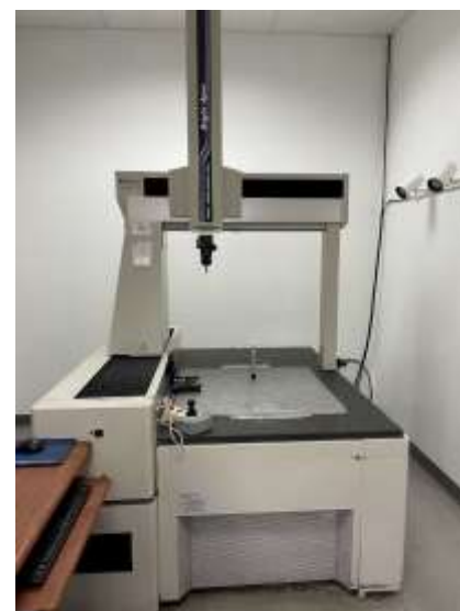
Figure 6: The coordinate measuring machine with its probe and two horizontal and vertical arms