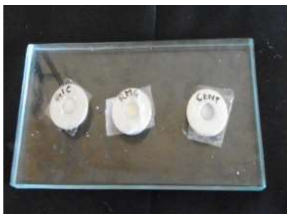
Figure 2. Prepared and labelled experimental specimens in metal molds