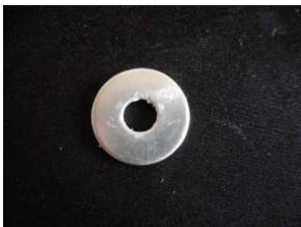
Figure 1. A metal mold used for specimen preparation with 8 mm internal diameter and 5.5 mm height

The disc diffusion method was used to determine the antibacterial activity. The blunt end of a micropipette tip was used to create three 5.5 mm-deep wells. Specimens from the experimental groups were transferred into and completely filled the wells (Fig. 3). The culture plates were kept at 37°C in an incubator for 48 h. A Vernier calliper measured the diameters of the inhibition zone around the specimens in millimetres (Fig. 4). The zone of inhibition was measured as the greatest distance between the two points at the outer limit of the inhibition halo formed around the wells. The zone of inhibition was calculated at time intervals of 3, 6, 12, 24, and 48 h. Three readings were taken for each specimen, and an average of three readings was recorded.