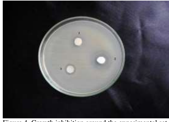
Figure 4. Growth inhibition around the experimental set specimens at 24 h