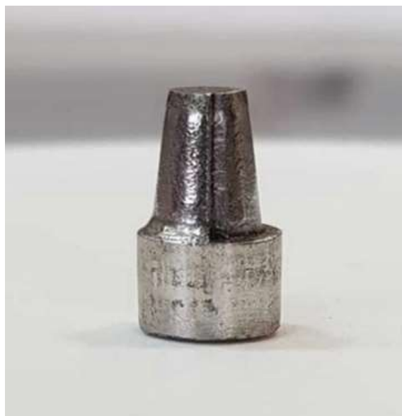
Figure 1: The chrome-cobalt standard die with two cervical finish lines

The standard die was replicated 9 times with putty and wash technique using a polyvinyl siloxane elastomeric material (Betasil, Addition Curing Polyvinylsiloxane, Type 0, Putty Consistency, Germany & Betasil, Addition Curing Polyvinylsiloxane, Type 3, Light-bodied Consistency, Germany). The sample size was determined