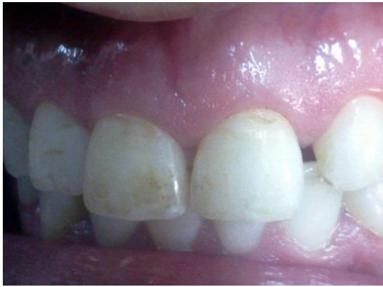
Figure 5. Clinical view after 4-years follow-up