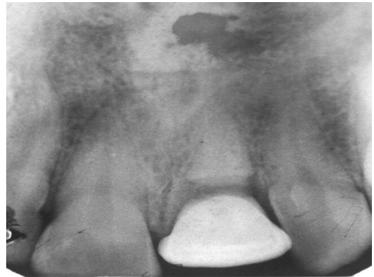
Figure 7. Initial radiograph indicating the fracture line in the left maxillary central incisor, 3 weeks after trauma