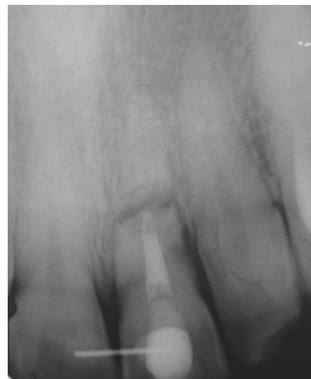
Figure 9. Radiographic view after 4-years follow-up indicates healing in fracture line