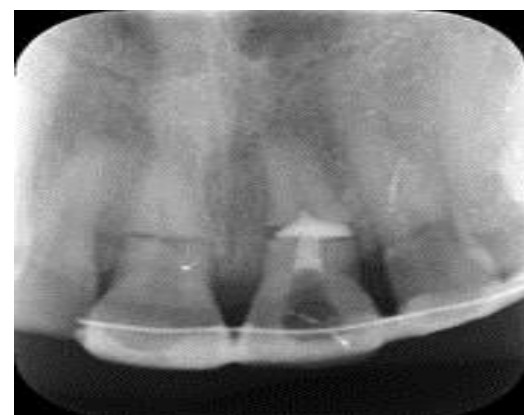
Figure 3: Final radiograph indicating placement of MTA plug