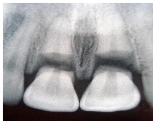
Figure 2: Initial radiograph indicating the fracture lines in both maxillary central incisors