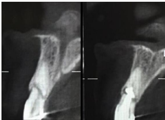
Figure 6. The CBCT image showed proximity of fractured parts in both incisors