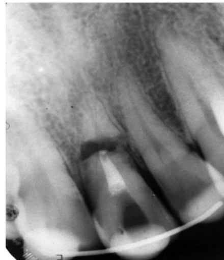
Figure 8. Final radiograph indicating placement of MTA plug