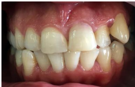
Figure 10: Clinical view after 4-years follow-up