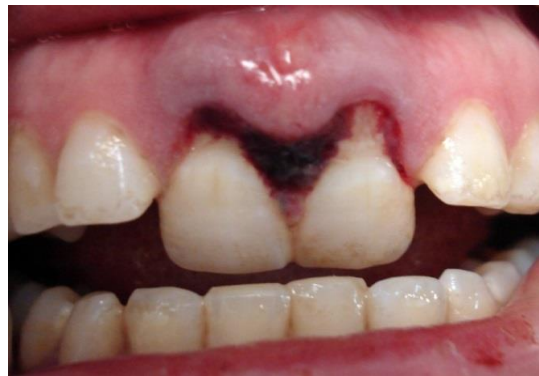
Figure 1: Initial photograph indicating the palatally displacement of maxillary central incisors

As evidenced by the periapical radiograph, complete healing at fracture line was obvious at 4-year follow-up and the tooth was clinically functional and the patient was asymptomatic (Figs. 9 and 10). The healing pattern of the fracture line seemed to be the interposition of bone and connective tissue.