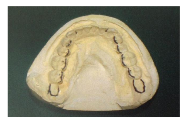
Figure 2. The lingual cusps and retromolar pad was marked on the casts

Data were analyzed with SPSS version 16.0 (Microsoft Inc., IL, USA). Absolute and relative frequencies were presented for each posterior tooth separately.