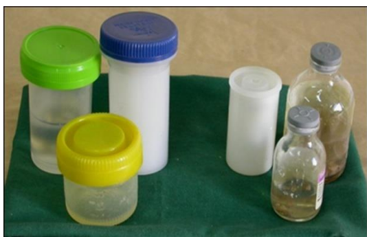
Figure 4. Appropriate (left) and inappropriate (right) biopsy containers