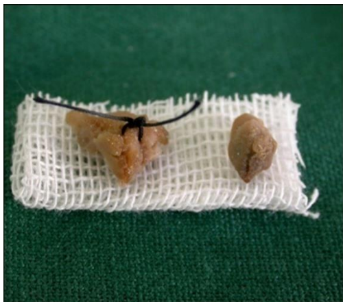
Figure 3. Samples of tongue (left – labeled with suture) and buccal mucosa (right)