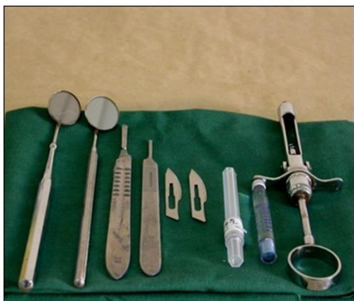
Figure 1. Some of instruments needed for biopsy

The biopsy specimen should immediately be placed in a fixating solution (14,22) because tissue autolysis takes place rapidly after resection and taking the specimen due to the disruption of blood supply to the tissue specimen (29). The best and most commonly used fixative is 10% neutral buffered formalin (22). Other solutions such as water, saline solution and alcohol are not suitable alternatives for formalin, as they cause severe and destructive changes in epithelial structures etc (Fig. 2) (33).