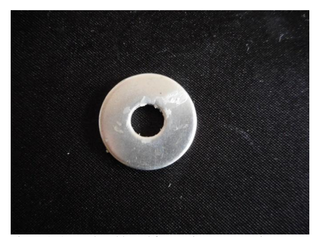
Figure 1. A metal mold used for specimen preparation with 8 mm internal diameter and 5.5 mm height

The disc diffusion method was used to determine the antibacterial activity. The blunt end of a micropipette tip was used to create three 5.5 mm-deep wells. Specimens from the experimental groups were transferred into and completely filled the wells (Fig. 3). The culture plates were kept at 37°C in an incubator for 48 h. A Vernier calliper measured the diameters of the inhibition zone around the specimens in millimetres (Fig. 4). The zone of inhibition was measured as the greatest distance between the two points at the outer limit of the inhibition halo formed around the wells. The zone of inhibition was calculated at time intervals of 3, 6, 12, 24, and 48 h. Three readings were taken for each specimen, and an average of three readings was recorded.