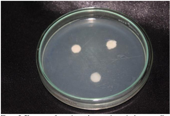
Figure 3. Placement of experimental set specimens in the agar wells