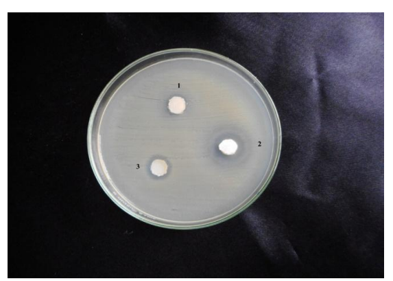
Figure 4. Growth inhibition around the experimental set specimens at 24 h