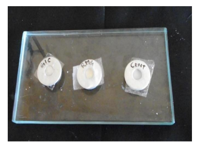
Figure 2. Prepared and labelled experimental specimens in metal molds