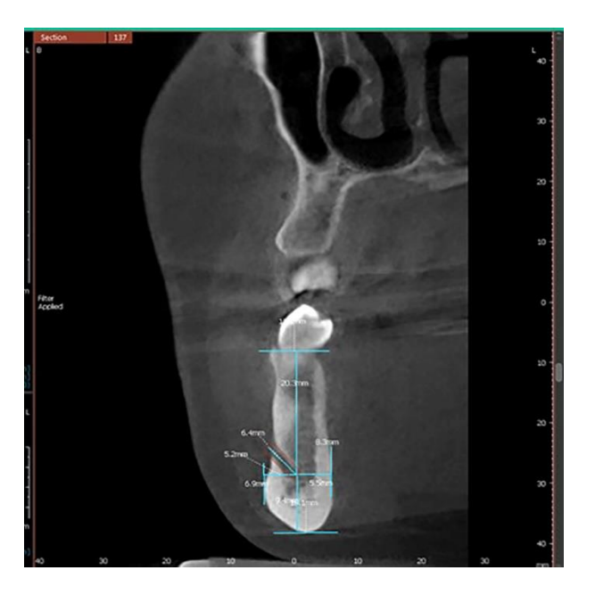
Figure 3: An example of measurements in the crosssectional profile of mental canal