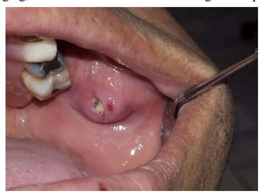
Figure 1: in the intraoral inspection a 2.5 \times 2 cm, same color of the mucous membrane swelling was seen

lesion was recognized; hence, the sialolithiasis diagnosis was suggested (figure 2). It was decided to remove the stone surgically with electrocautery (because of minimum bleeding, proper visibility and accessibility). After informed consent was obtained, the location of incision was selected to be out of the main duct at the anterior side of Stensen entrance to prevent ductal obstruction as well as mucocele formation in healing phase. The stone was extracted by an upward pressure and the wound was subsequently sutured (figure3). It should be mentioned that the total time of surgical process was about 10 minutes and the swelling disappeared at the end of the procedure. In addition, the patient felt comfortable immediately (figure 4). An interesting observation was that the actual size of stone after removal was 19×13.5 mm, which is a rare case. One month after the surgery, the patient referred for restorative treatment and he did not have any complaints of the former surgery.