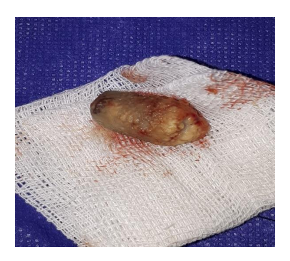
Figure 3: Picture of stone by excisional biopsy