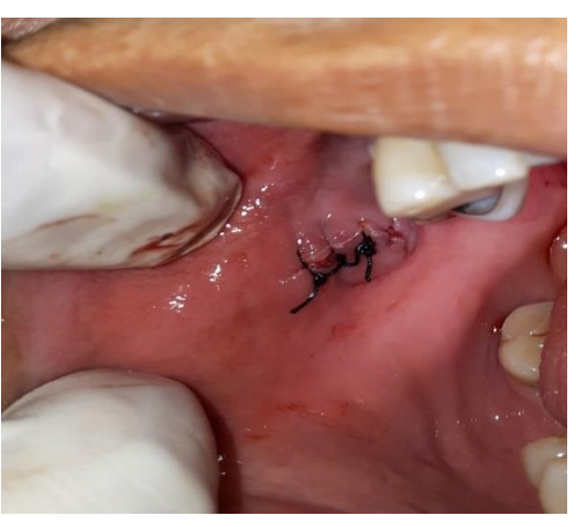
Figure 4: Picture of closure and suturing after excision